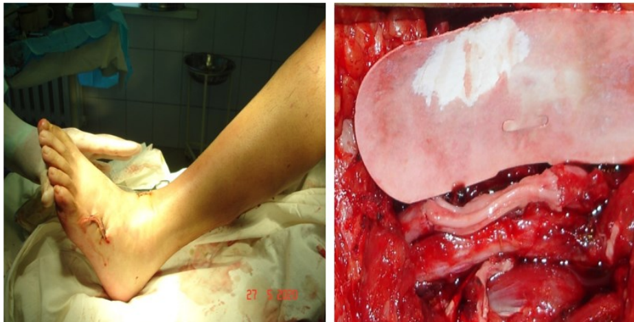
Figure 4. Autoplasty of the sciatic nerve depicts a surgical site involving the sciatic nerve, likely showing the process of autoplasty (left) and the result of tendon-muscle plasty (right) (The Neurosurgical Centre of City Clinical Hospital No. 7, Almaty, Kazakhstan, 2022)

that conditions related to the sciatic nerve predominantly affect younger individuals, particularly those in their prime working years. This demographic factor has substantial implications for productivity and quality of life. Therefore, it is essential to consider not only the medical aspects but also the economic ramifications of treating these patients. Restoring their ability to work can significantly decrease the costs associated with long-term medical care and disability benefits (32).