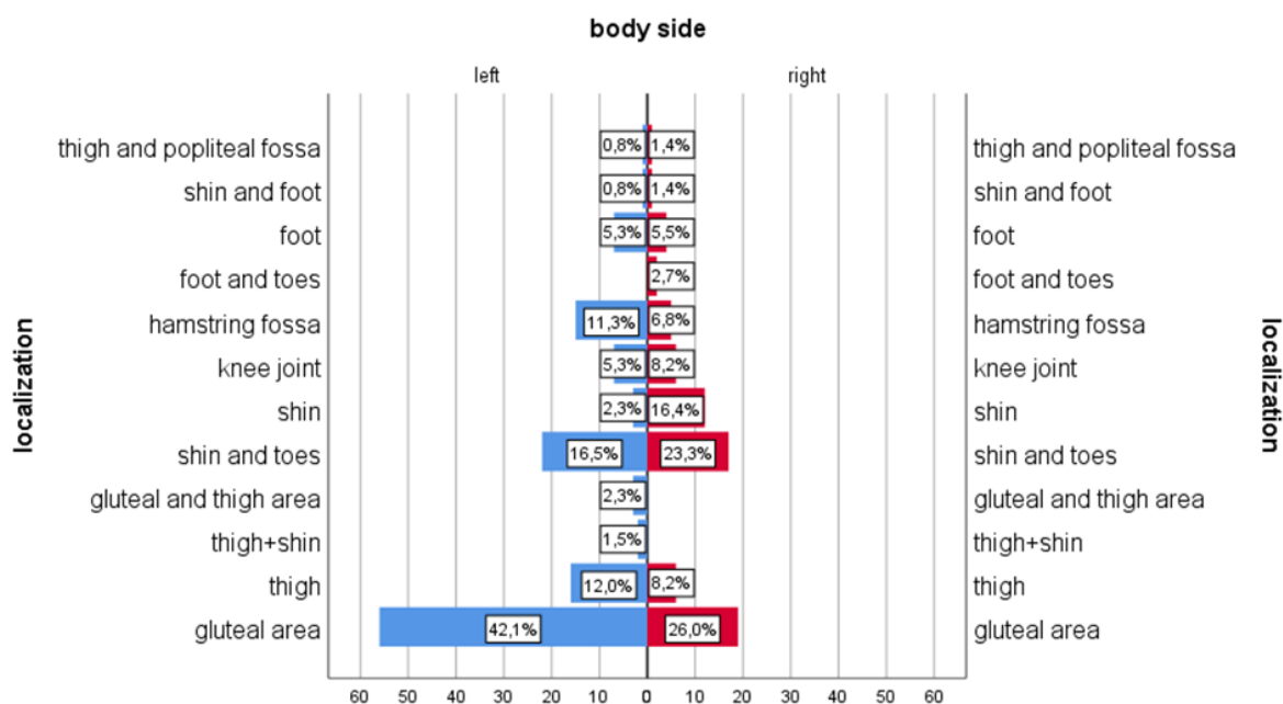
Figure 2. Localization according to the side of the body of patients